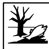
Dangerous for the Environment